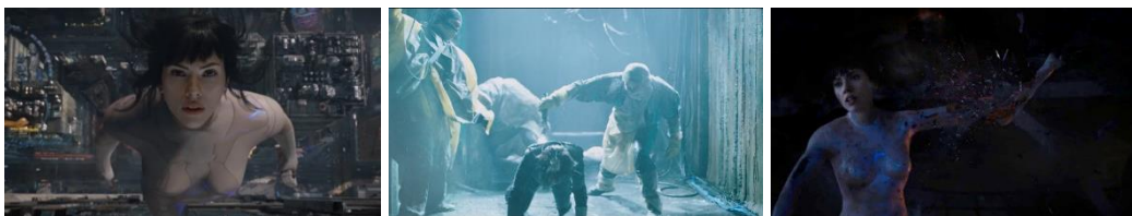
Figure 8. Major when she jumps off the building, being electrocuted, and ripped off her arms

Major is also portrayed to be powerful because of the technological enhancement that she got. She is frequently portrayed that her own body is pushed past its limits such as jump off the buildings, being electrocuted, and ripped her arms off.