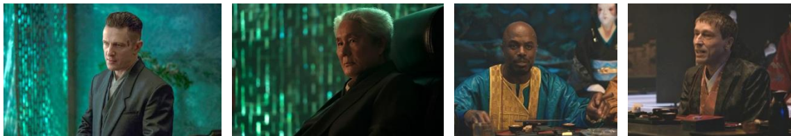
Figure 1. Men as the high-rank officials