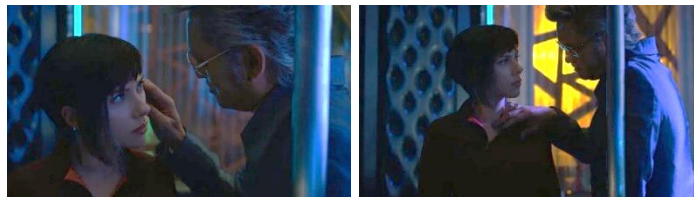
Figure 7. Major is touched by a guy at the yakuza club.

The portrayal of Major as a sexual object also appears when Major does the mission.