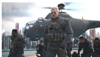
Figure 3. Public Security Section 9

Those pictures are the armies presented in this movie. The first picture is the terrorists that attack the President of the African Federation, and the second picture is Hanka's security team. Both of those armies are dominated by men.