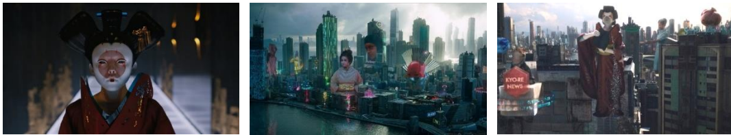
Figure 4. The robotic geisha and the advertisements in town

The appearance of robotic geisha and the advertisements in the city depict how New Port City is the portrayal of patriarchal society.