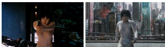
Figure 6. Major using her invisible suit for some missions.

Furthermore, the exposure of the Major's body is depicted in another scene. Her ability to become invisible requires her to use a costume.